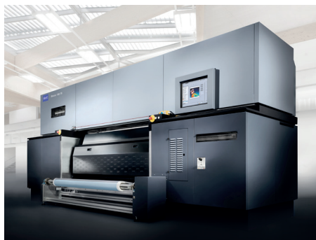
Rhotex 180 TR

With the new Rhotex 325, the Rhotex Series has now implemented an efficient high-end production process, to increase cost effectiveness, confirming its role as European market leader, and expanding its global position.