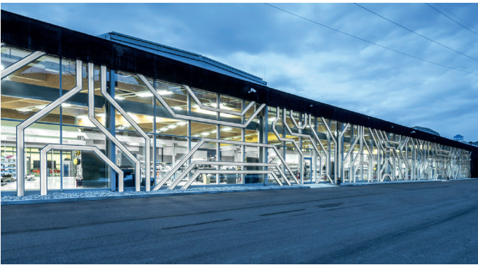
Durst location in Brixen, Italy

Durst is a family-owned company with an 80 year history of values focused on innovation, customer orientation, sustainability and quality.