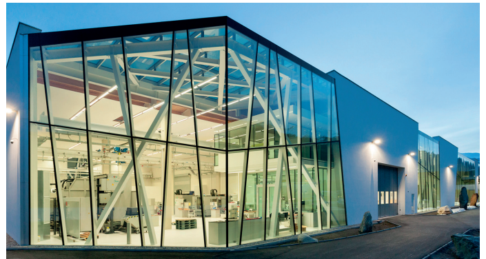
Durst location in Lienz, Austria