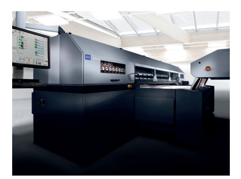
Rhotex HS > Page 11