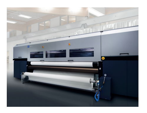
Rhotex 325 > Page 6

Digital large format printing technology offers an extremely wide-range field of application, and revolutionizes production processes in many industrial categories. The broadest application of digital Large Format Printing is in the production of marketing and communication media for trade, POP/POS and Out-Of-Home. Due to its universal value, special applications for museums, interior (wall coverings, furniture, flooring), or industrial printing are also produced by Durst customers globally with this technology. For fifteen-plus years Durst has played a major role in adapting industrial inkjet printing solutions in many segments which include large-format printing, ceramic tile printing, label- and packaging printing and textile printing.