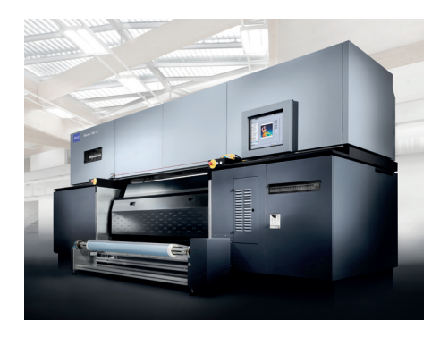
Rhotex 180 TR > Page 8

With the new Rhotex 325, the Rhotex Series has now implemented an efficient high-end production process, to increase cost effectiveness, confirming its role as European market leader, and expanding it global position.