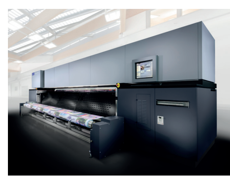
Rhotex 500 > Page 10