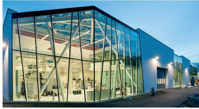
Durst location in Brixen, Italy

Durst is a family-owned company with an 80 year history of values focused on innovation, customer orientation, sustainability and quality.